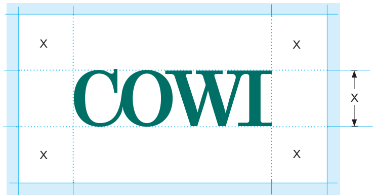
COWI logo with clear space

The logo must always stand out and be easy to read. This is ensured by allowing for a minimum clear space around the logo. The clear space is determined by measuring the height of the logo (the x-height) and as a minimum, surrounding the logo with a clear space of this measurement. There must be no graphic elements, typography or other colours within the clear space. The matrix is illustrated to the right.